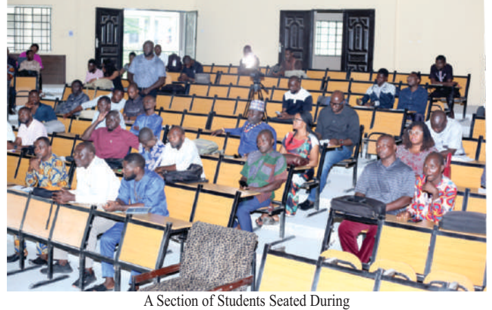
A Section of Students Seated During CIPESS JOSTUM Postgraduate Research Clinic