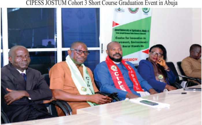
Members of CIPESS JOSTUM Management Team Seated During Cohort 3 Short Course Graduation Event in Abuja