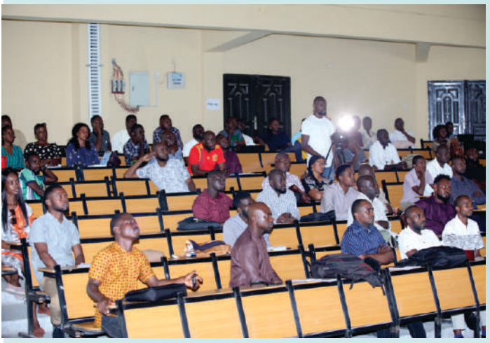
A Section of students During CIPESS JOSTUM Postgraduate Research Clinic

AI, stating that it may increase user productivity, improve language and grammar, and produce ideas and content for the user. Other applications include conducting literature searches on academic databases, summarizing enormous amounts of information, and providing writing aid. In contrast, she claimed that some of the drawbacks associated with the employment of Artificial Intelligence software included the possibility of producing unoriginal content, incorrect use of AI tools, misreading of AI-produced proposals, and non-reference of the generated information.