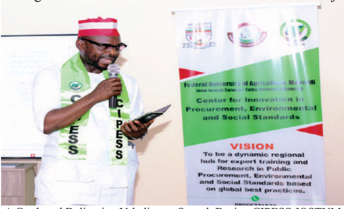
A Graduand Delivering Valedictory Speech During CIPESS JOSTUM Cohort 3 Short Course Graduation Event in Abuja