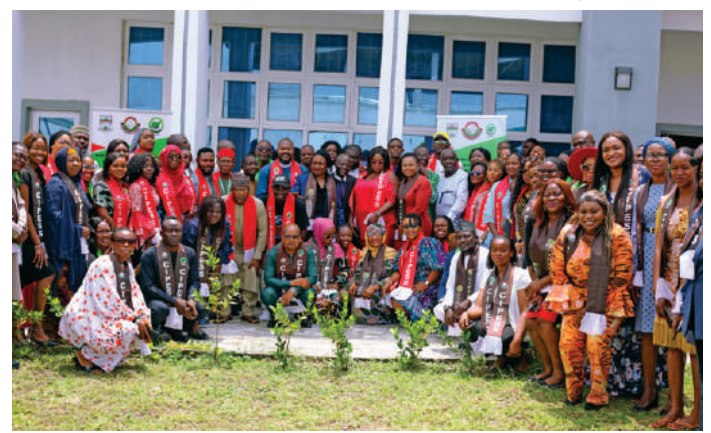
CIPESS JOSTUM Management Team and Graduands During Short Course Cohort 3 Graduation Event in Abuja