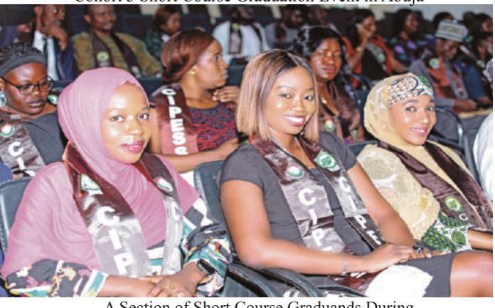
A Section of Short Course Graduands During CIPESS JOSTUM Cohort 3 Graduation Event in Abuja