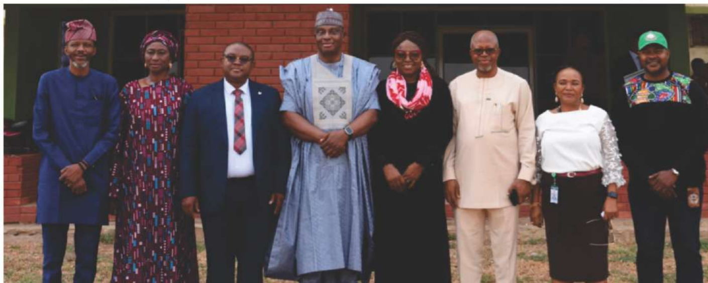
JOSTUM Vice Chancellor, Members of IPESSE Management Team and Guest Speakers at IPESSE 2026 International Symposium During a Courtesy Visit on the Vice Chancellor.