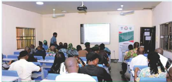
IPESS JOSTUM Participants in Class during Advanced Certificate Course Training in Makurdi, Benue State

P articipants of the advanced certificate course (Track B) programme at the Institute of