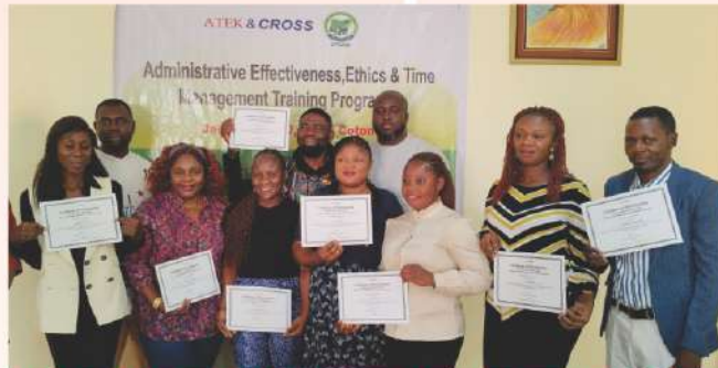
IPSS JOSTUM Staff Showcase Certificates After a 5-day Intensive Training Programme in Cotonou, Benin Republic.