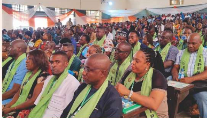
A Section of Advanced Certificate Course Graduands in Environmental Sustainability during IPSS JOSTUM 2026 International Symposium

As the world increasingly prioritises ethical procurement and sustainable practices, the role of IPSS JOSTUM becomes even more critical. Her ongoing commitment to empowering professionals with the right skills and knowledge contributes not only to individual success but also to broader societal progress. Through continuous training, certification, community building, and strategic partnerships, the institute will continue to exert its relevance and be responsive to the ever-changing demands of specific sectors. With its legacy of achievement and forward-looking vision, IPSS JOSTUM is well-positioned to continue leading the charge in human capacity building, sustaining its vital tempo for years to come.