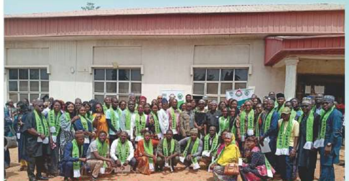
IPESS JOSTUM Team and Graduands during Track B Valedictory Event in Jos, Plateau