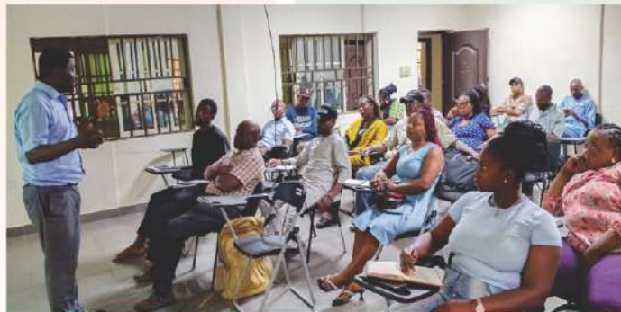
A Class session during Advanced Certificate Course Training in Makurdi

Again, one salient contribution of IPESSE JOSTUM is the building of a community of practice. Beyond training and certification, IPESSE JOSTUM fosters a vibrant community of practice that connects past and present trainees. This network becomes a platform for knowledge sharing, mentorship, and collaboration on projects that advance procurement and sustainability standards. Alumni engagements, workshops, and seminars organised by the institute help maintain professional relationships and encourage continuous learning. This community aspect amplifies the impact of the training