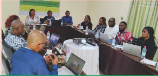
IPSS JOSTUM Staff in Session during a 5-day Intensive Training Programme in Cotonou, Benin Republic.