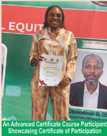
An Advanced Certificate Course Participant Showcasing Certificate of Participation

Institute of Procurement, Environmental and Social Standards (IPESSE), Joseph Sarwuan Tarka University, Makurdi (JOSTUM) is among the leading institutions on the Sustainable Procurement, Environmental and Social Standards Enhancement (SPESSE) project, making a significant impact in developing sustainable human capacity in the areas of procurement, environmental and social standards in the North Central region of Nigeria. The institute has not only carved a niche for itself not only through its high-quality training programmes but also through its consistent drive to sustain and expand its capacity-building efforts.