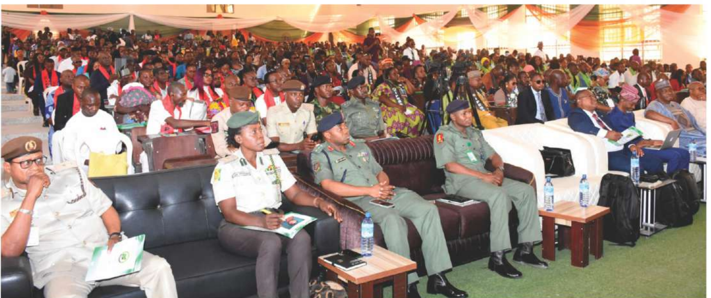
Invited Guests, Guest Speakers and Participants Seated during IPESS JOSTUM 2026 International Symposium