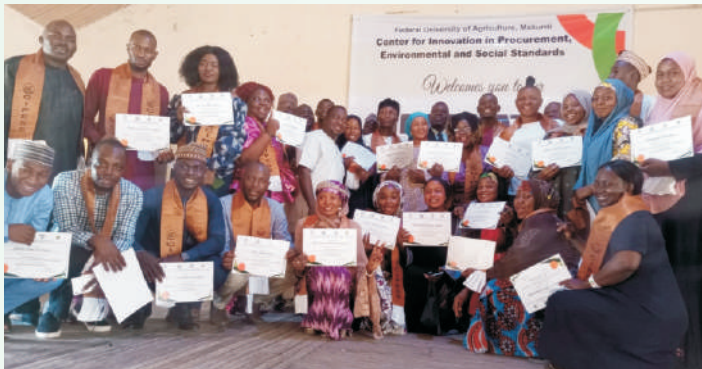
Keffi Center Graduands Display Certificates