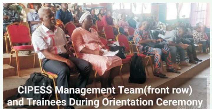
CIPESS Management Team(front row) and Trainees During Orientation Ceremony