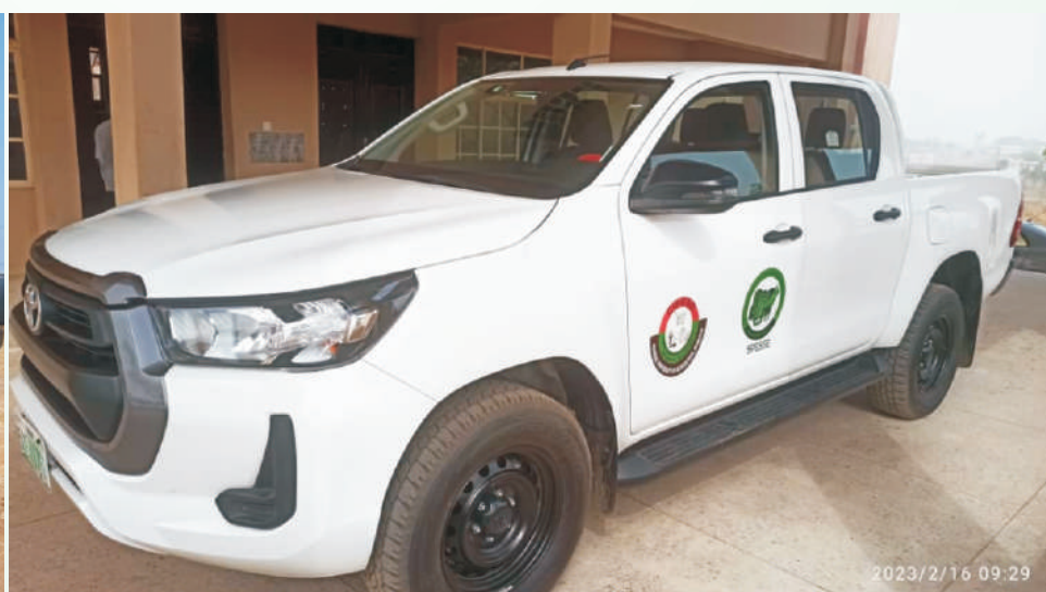
CIPESS Newly Acquired Vehicles