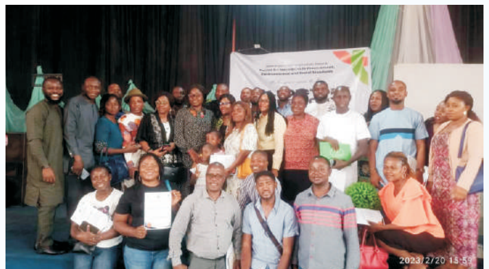
Center Leader and Director CIPESS with Graduands