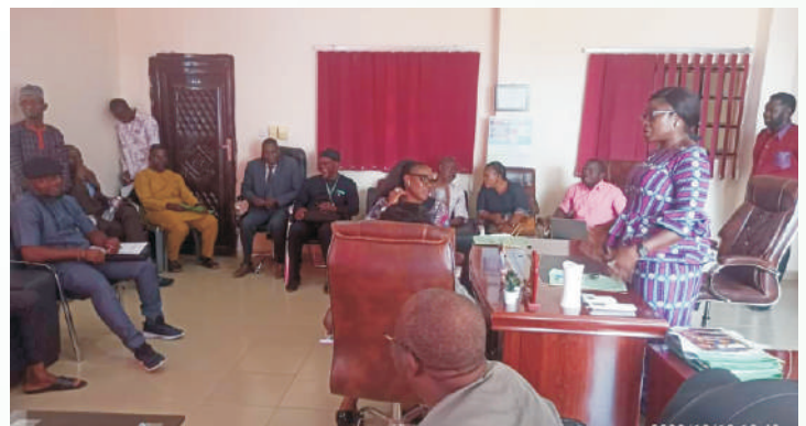
CIPESS MANAGEMENT WITH NUC TEAM DURING A VISIT