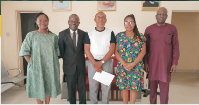
Cipess Team & Disability Rights Advocacy Center, Abuja