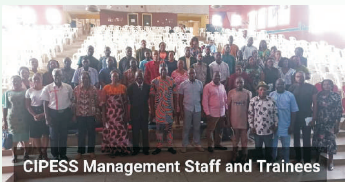
CIPESS Management Staff and Trainees