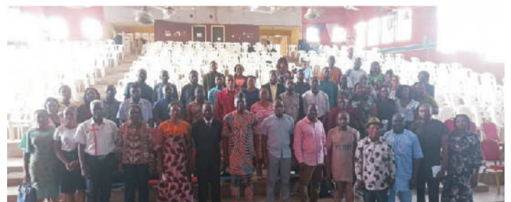
CIPESS MANAGEMENT AND TRAINEES