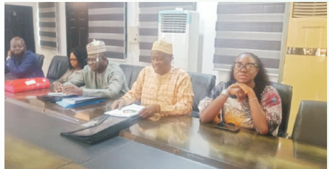
A Section of NUC Team during a Visit to CIPESS