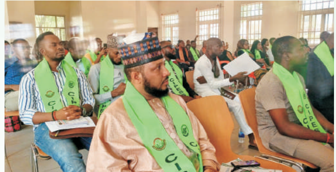
Cross Section of Short Courses Participants in Abuja