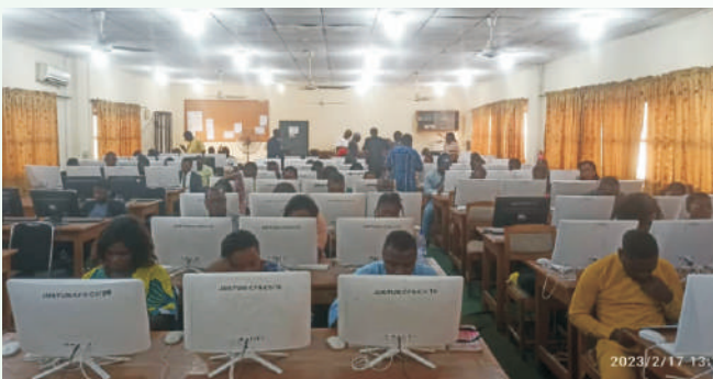
CIPESS 1st set of Track B Trainees taking an exam