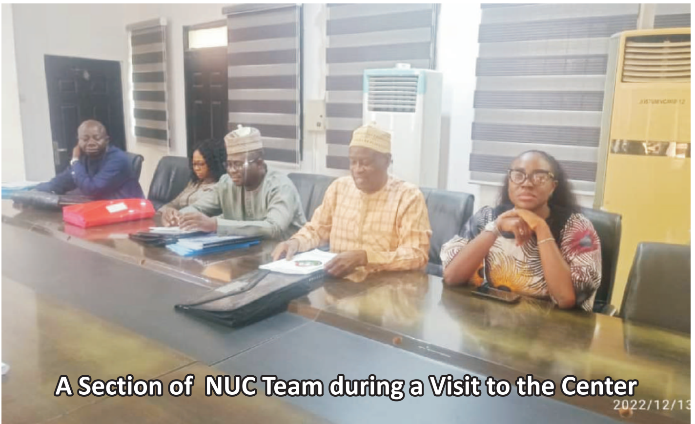
A Section of NUC Team during a Visit to the Center

The Commission however enjoined the University to provide adequate human and material resources by recruiting more lecturers in the core areas and providing more relevant books for the development and growth of the programmes.