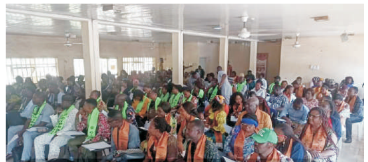
GRADUANDS SEATED AT THE EVENT

Noteworthy, training and issuing of short courses certificates to participants has become a routine at the Center since commencement. Consequently, hundreds of participants from various spheres of life have benefitted from this