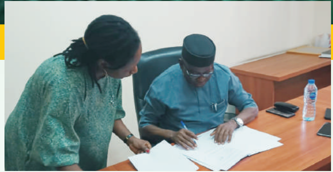
Signing of MoU between CIPESS-FUAM & AUST, Abuja