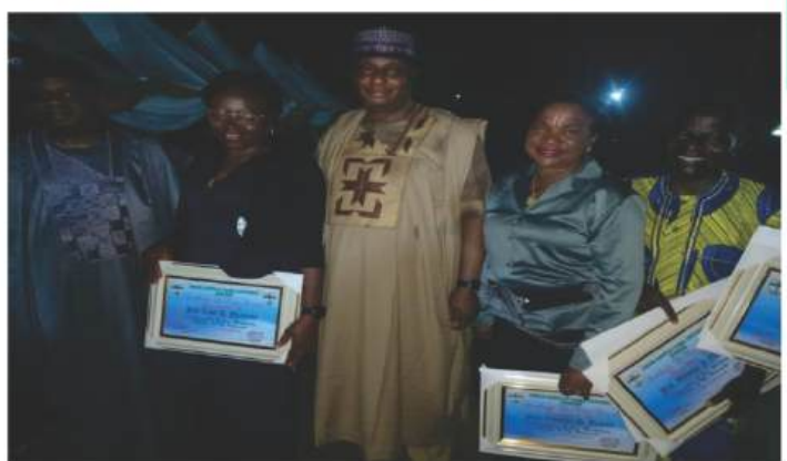
JOSTUM Vice Chancellor and CIPESS Management Team