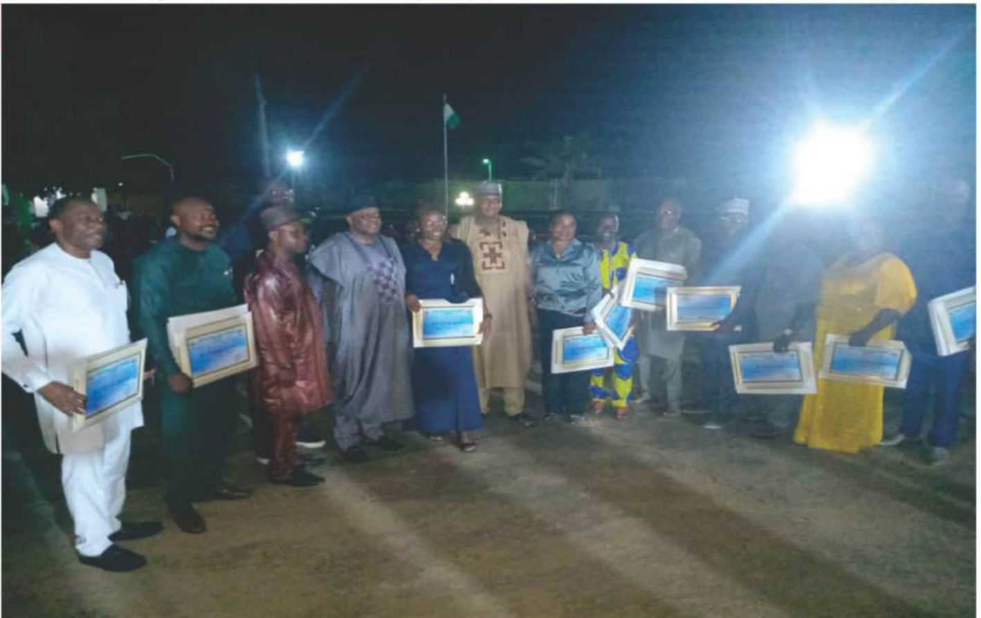
JOSTUM 9th Governing Council, University Management Team and CIPESS Team Holding Merit Award Certificates