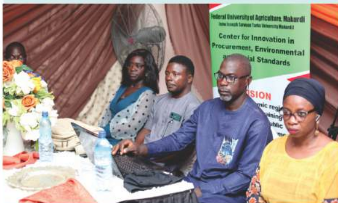
A Section of Participants During CIPESS JOSTUM Stakeholders Engagement Meeting in Makurdi