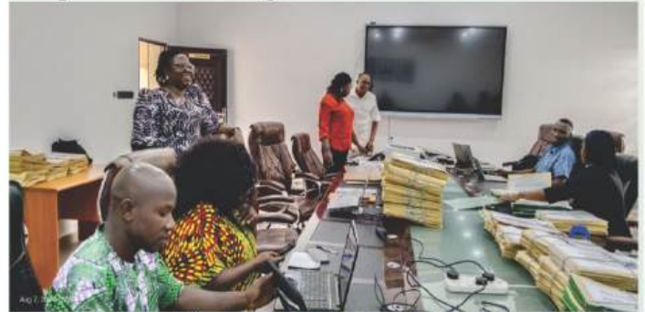
Center Leader and Director, World Bank Independent Verification Team and CIPESS JOSTUM Data Officer During 4 th Round Verification Exercise in CIPESS