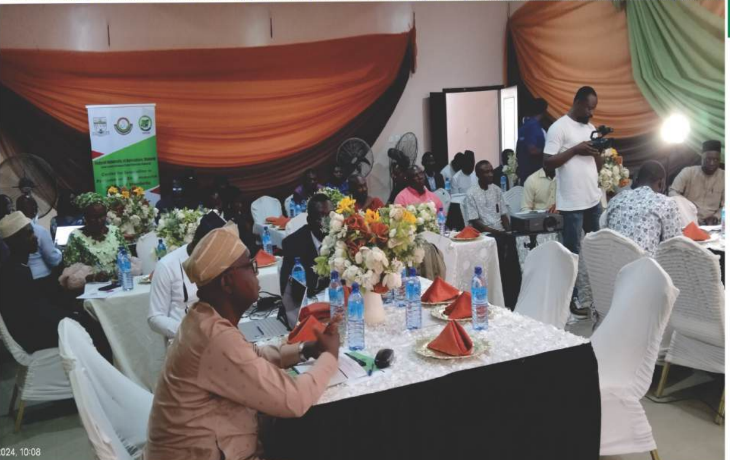
Participants Seated During CIPESS JOSTUM Stake Holders Engagement Meeting in Makurdi