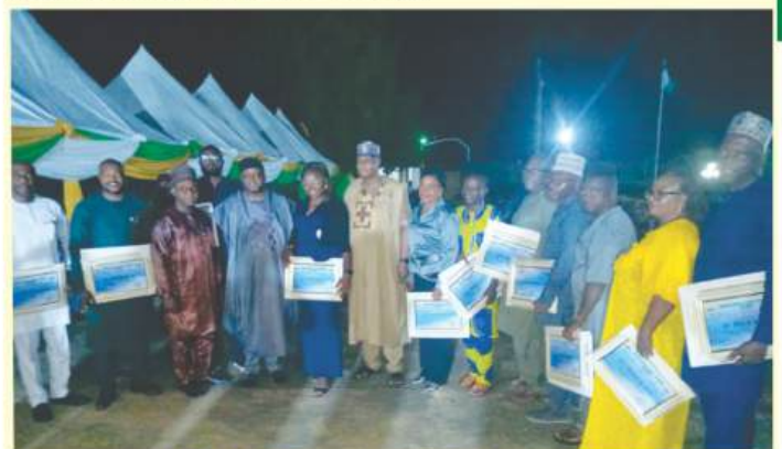
JOSTUM 9 th Governing Council, University Management Team and CIPESS Team During the Award Ceremony