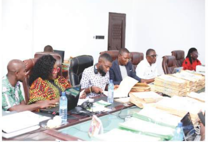
Independent 3 rd Party Verification Agents and Data Officers during the 4 th Round Verification Exercise in CIPESS Boardroom.